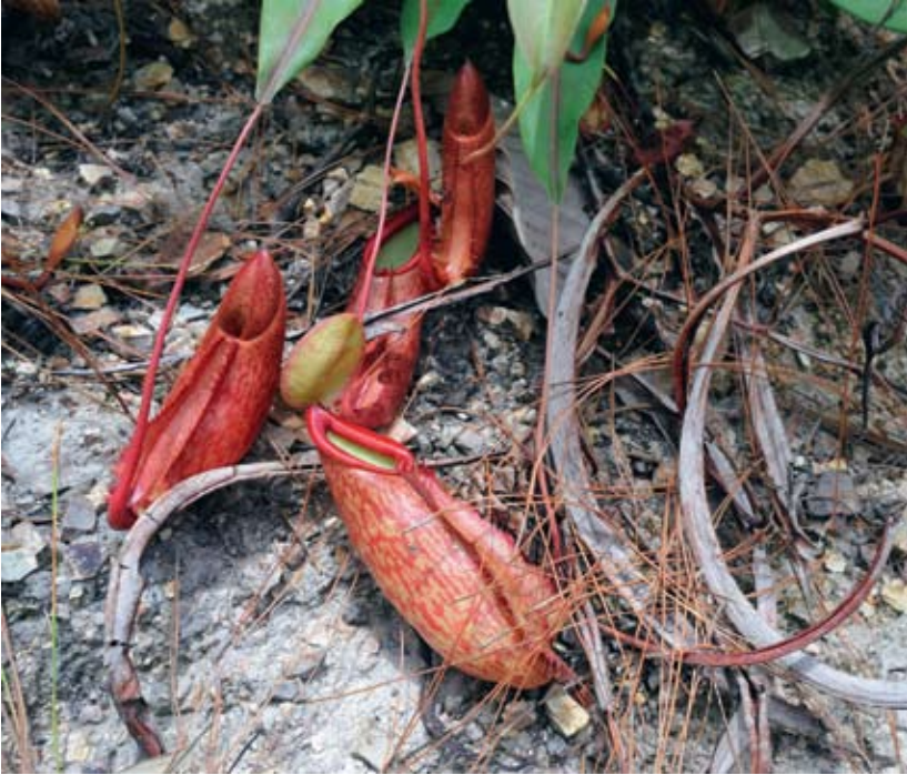
Figure 777 (above). Lower pitchers of Nepenthes holdenii are often speckled with red blotches.