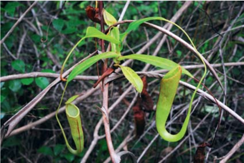
Figure 780 (above). An aerial rosette emerging from a dried climbing vine.