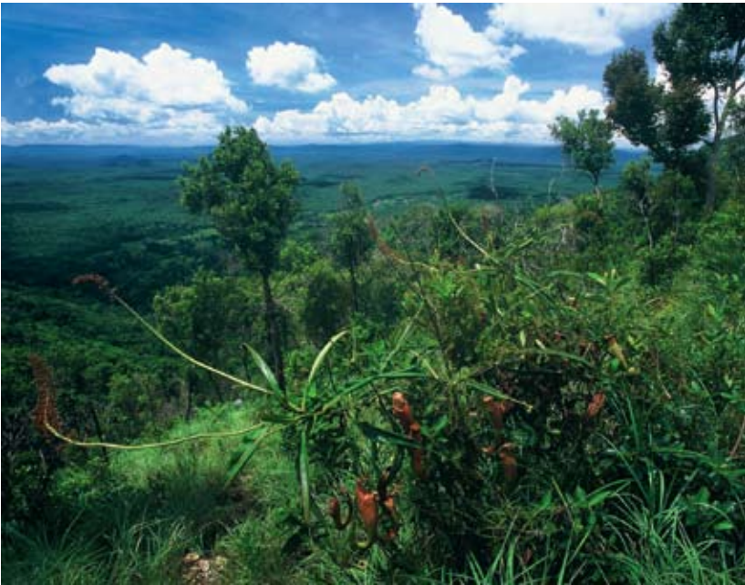
Figure 771 (above). Nepenthes holdenii growing at 700 m altitude on a sandstone ridge.