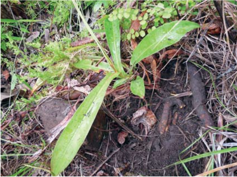
Figure 772 (above). The tuber rootstock of Nepenthes holdenii , typical of the Nepenthes thorelii aggregate.

forest. The lowland evergreen forest of the Cardamom range is mainly composed of tall trees such as Lagerstroemia (Lythraceae), Anisoptera and Dipterocarpus (Dipterocarpaceae), Ficus (Moraceae), as well as some emergent legumes, various species of bamboos, rattans and lianas are also very common. The hill evergreen forest, occurring more or less between 700 and 800 meters above sea level, is shorter and composed of trees like Lithocarpus (Fagaceae) and Syzygium (Myrtaceae) (Neang & Holden, 2008). In both localities, N. holdenii grows on steep ridges in peaty soil, in bright to fully exposed areas (Figure 771). The first locality ( Mey 1 , Neang & Holden 1, 2, 3, 4, 5, 6 ) is semi-exposed. Plants grow in full sun or under the part-shade of short trees. The forest floor is generally covered with leaf litter. Some small, undiagnosed lithophytic Orchidaceae, large succulent plants which look like species from the tribe Euphorbieae and a species of terrestrial mistletoe belonging to the genus Dendrophthoe Mart., occur in this area. The second locality ( Mey 7 ) is open and drought appears to be severe in the dry season. Nepenthes holdenii occurs on steep ridges at the foot of a loose network of short trees and pines. A species of fern and species of myrmecophilous plants like Hydnophytum Jack (Rubiaceae), Dischidia rafflesiana Wall., as well as