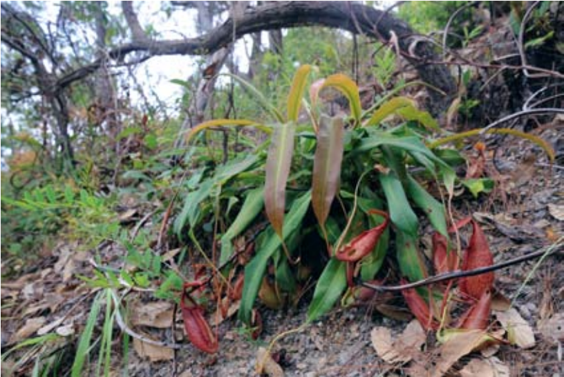
Figure 775 (above). A rosette plant growing during the wet season. Note the pine leaves.