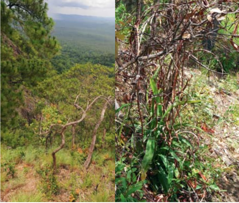
Figure 773 (above left). The habitat of N. holdenii can be very dry even during the wet season. Figure 774 (above right). A large rosette of N. holdenii growing back on the wet season. Note the dead climbing vines, remnants of the dry season.