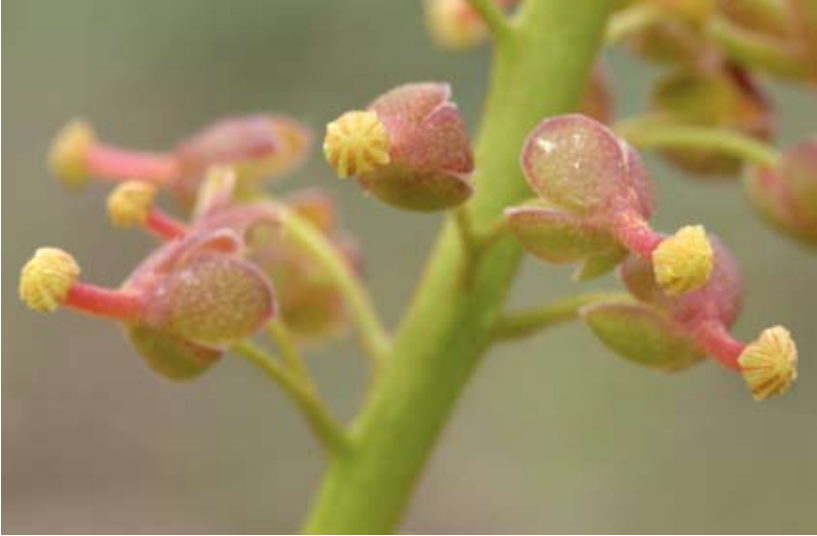
Figure 776 (above). A detail of the flowers of Nepenthes holdenii . Note the 2-flowered partial peduncles.